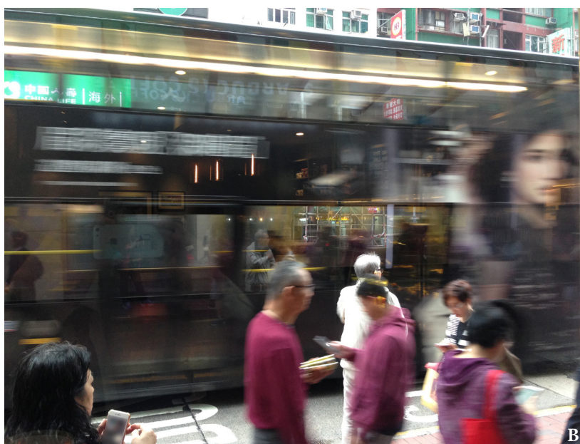
FIGURE. Cover page of the journal (A) and its original photograph (B) demonstrating society from the coffeehouse window as of March 30, 2017. Location: 313–317 Hennessy Road, Wan Chai, Hong Kong, Special Administrative Region (SAR), China. Personal photo from a scientific conference trip.

In summary, we want to wish on behalf of the publishing house staff all the best to newly formed editorial board and to say thank you for leadership in the communication direction.